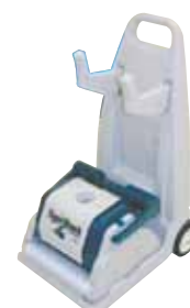
Trolley with Tiger Shark